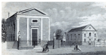
From Zion Chapel to Christ Church A story of Congregationalists in Enfield

From Zion Chapel to Christ Church: A story of Congregationalists in Enfield is a 48-page, A4-size book by Stephen Gilburt that recounts the history of the churches since 1780. It is illustrated with over 100 prints and photographs, many of them in colour, of Zion Chapel, Chase Side Chapel and the Grade II listed Victorian Gothic Christ Church which replaced them, together with pictures of ministers, members and activities.